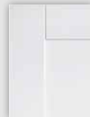
Stile and rail

Moda is factory primed for a smooth minimalist aesthetic that can't be overlooked. Its boldness lies in its simplicity.