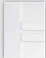
Square fitting rails